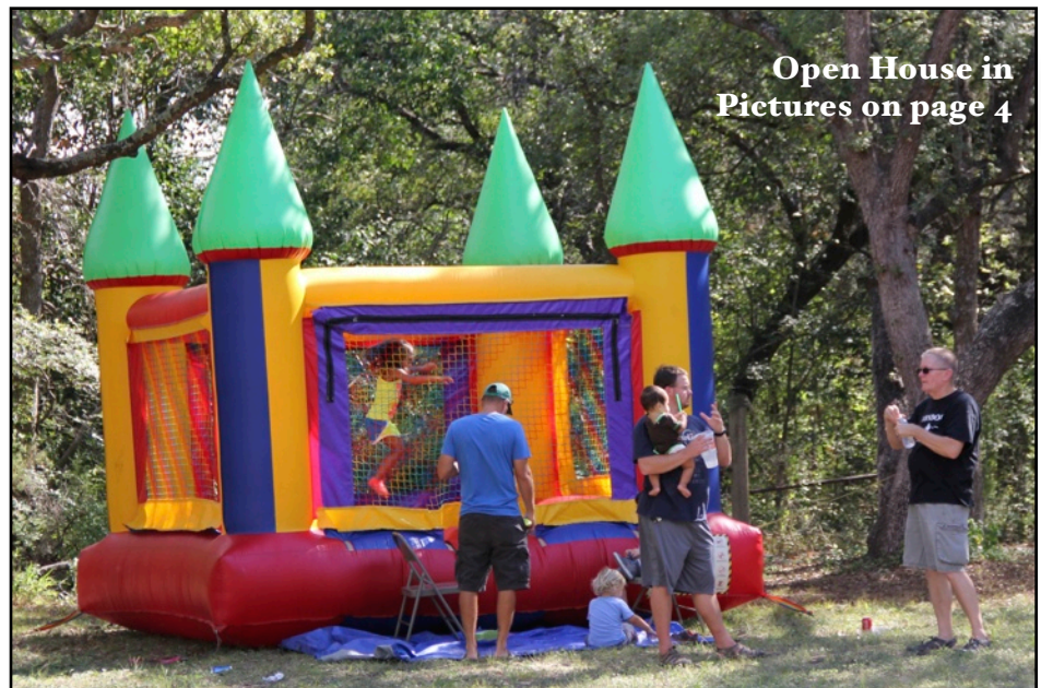
Open House in Pictures on page 4

We hope to see you at the AAD meeting this coming Saturday, October 12th at 7:30 pm.