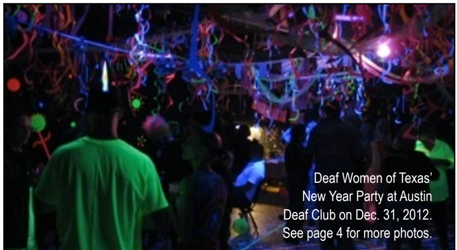
Deaf Women of Texas' New Year Party at Austin Deaf Club on Dec. 31, 2012. See page 4 for more photos.