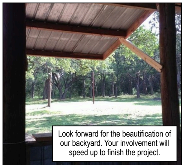
Look forward for the beautification of our backyard. Your involvement will speed up to finish the project.