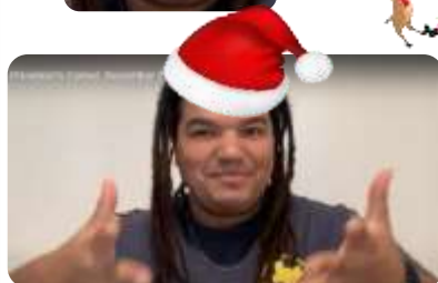
Vlog Message: https://youtu.be/ZdkSZeAi-hgI

Hello AADians, I hope y'all doing well. I would like to share 6 updates for the month of December.