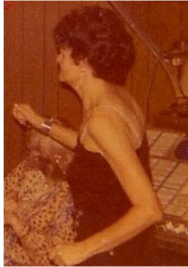
New Year Party 1977