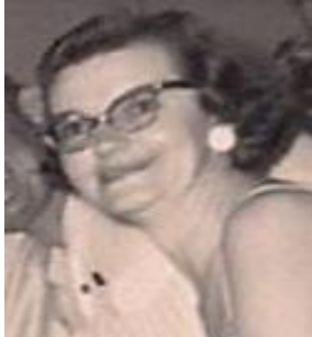
Social Night 1958